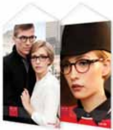
DOUBLE SIDED KLiik BANNER 26" x 42" | 66cm x 107cm K0072