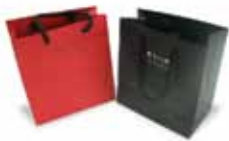
KLiik BAGS K0002