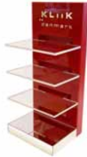
KLiik COUNTER DISPLAY K0005