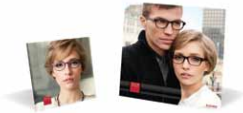
KLiik COUNTER CARD SET 5.5" x 5.5" | 14cm x 14cm female 6.5" x 6.5" | 16.5cm x 16.5cm couple K0071