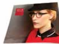
KLiik IN-STORE CLEANING CLOTH 11.5" X 12" | 29cm x 30.5cm K0037