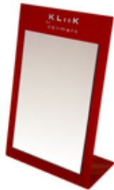
KLiik MIRROR K0007