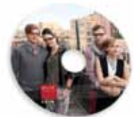
KLiik VIDEO K0045