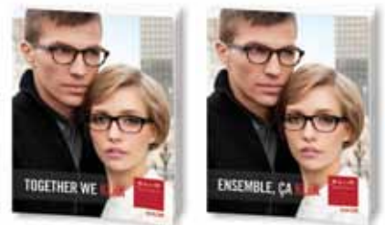
KLiik BROCHURE ENGLISH | K0074 FRENCH | K0075