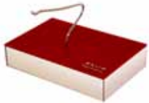
KLiik 1 PC DISPLAY K0003

As support for your commitment to the brand, we want to help set you up for success. Choose from a full suite of flexible banners, counter cards and display pieces for multiple store configurations.